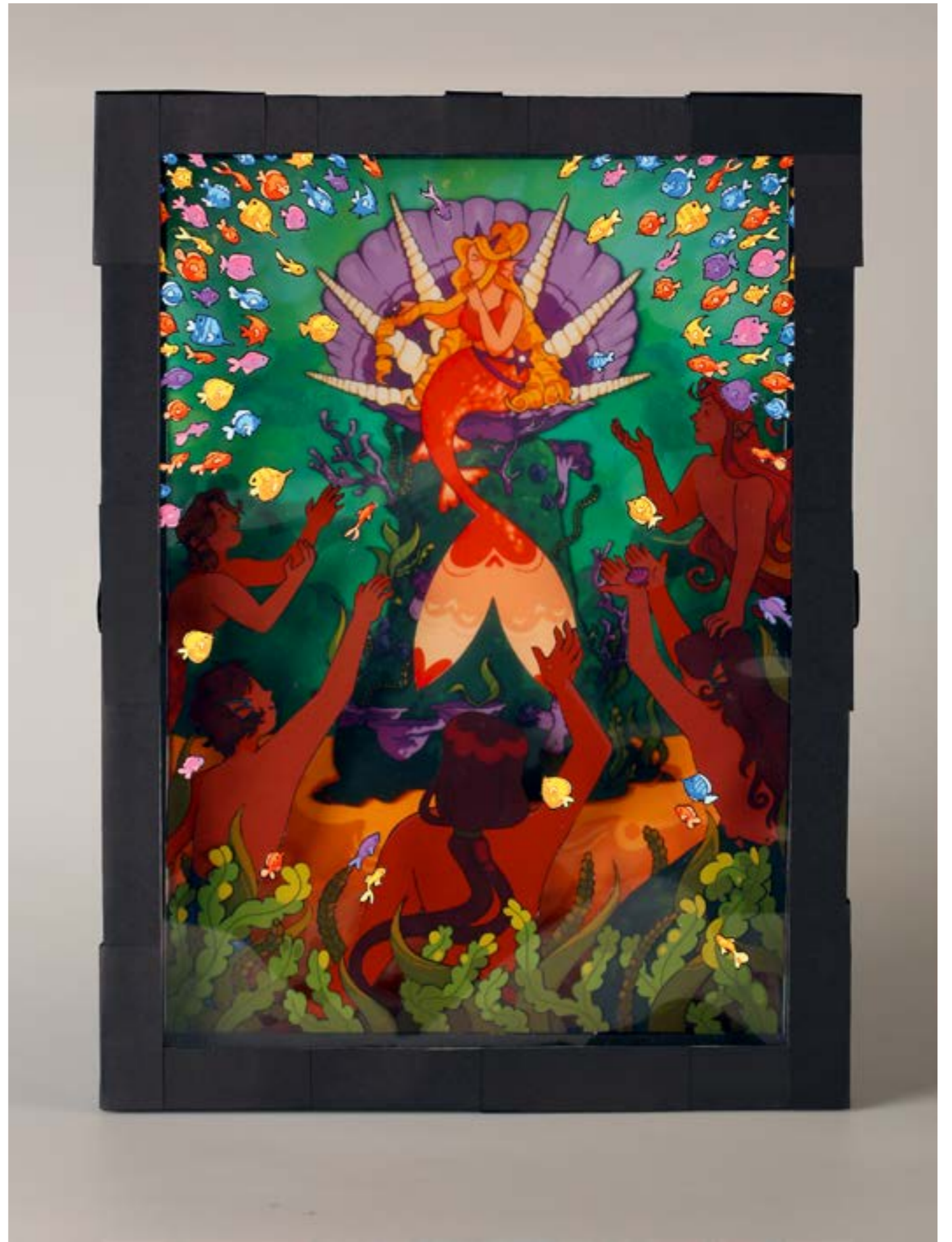
The final piece photographed from both a front and slight side angle to show the layers.