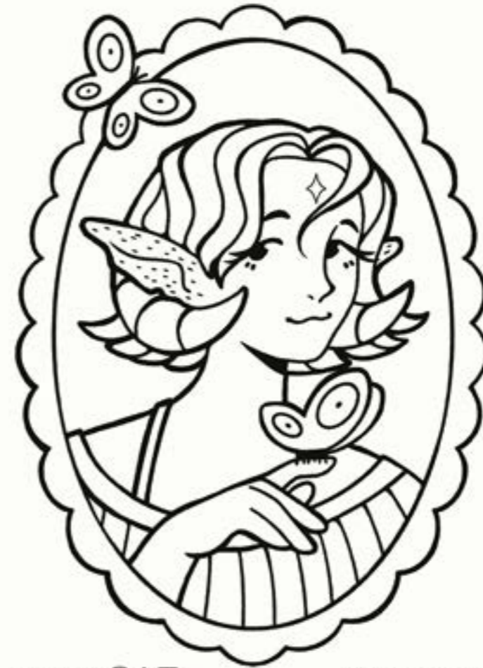
@kingtalart @tiktok @youtube