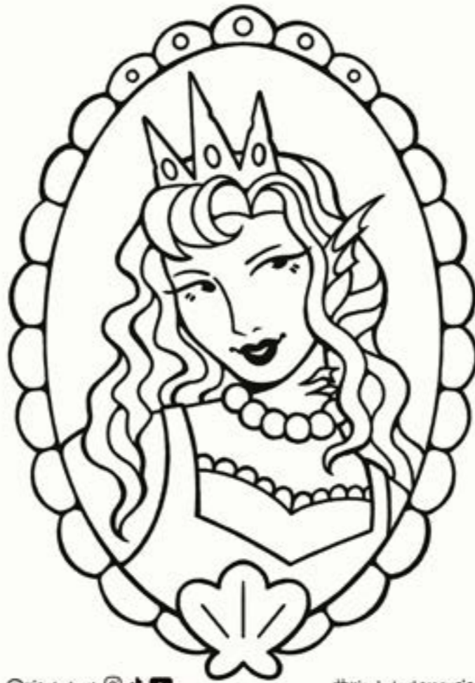
@kingtalart @tiktok @youtube