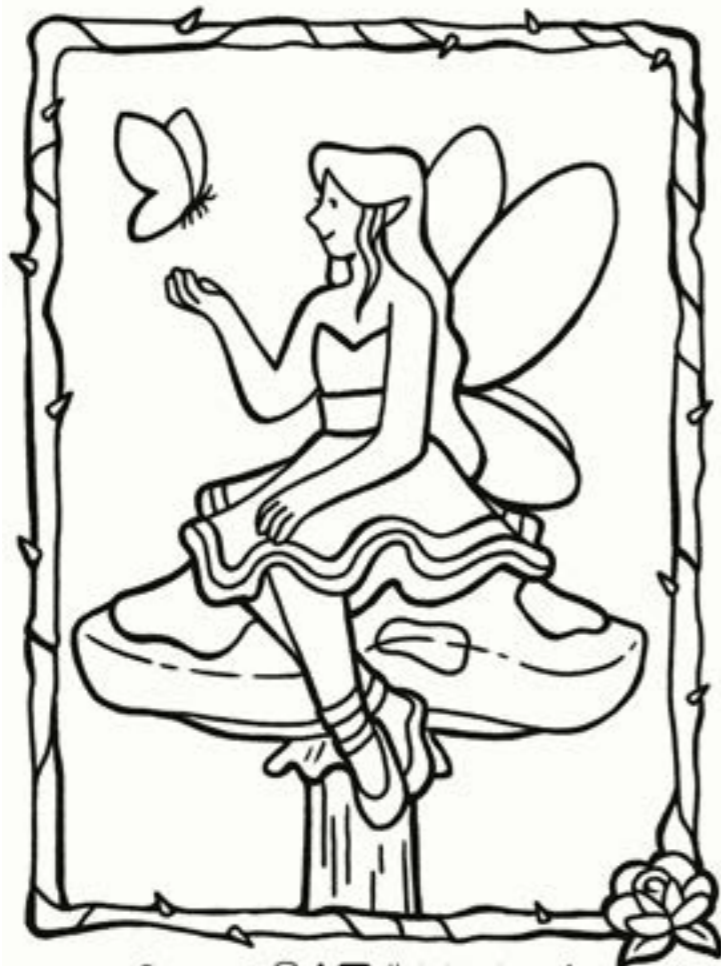
@kingtalart @tiktok @youtube #kingtalartcolouring