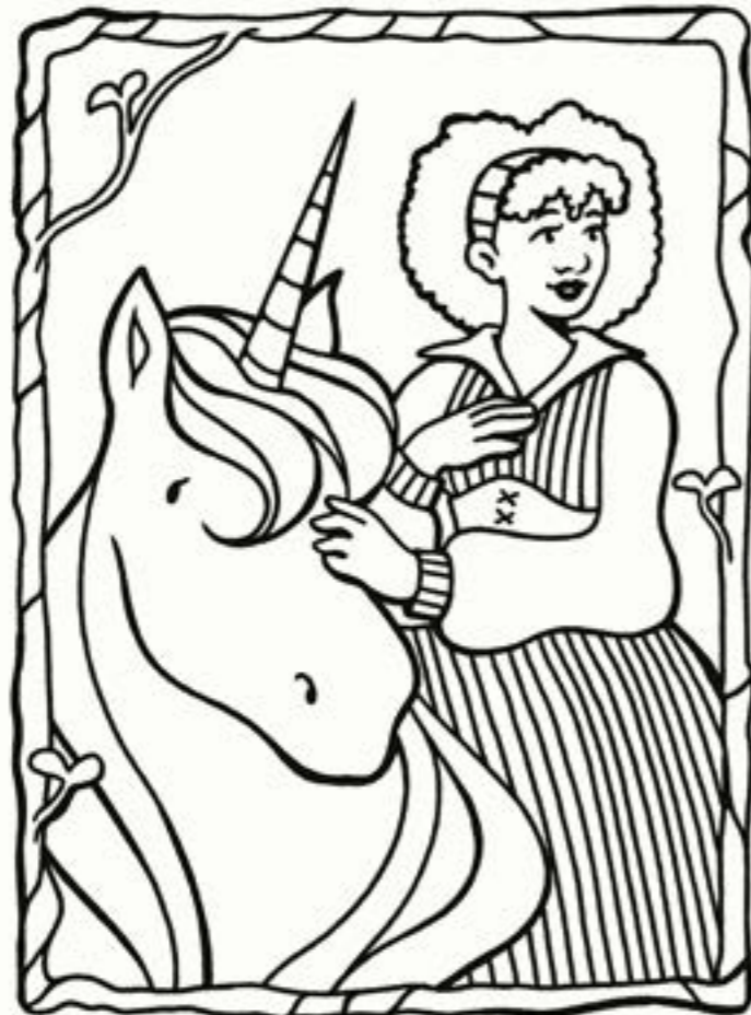
@kingtalart @tiktok @youtube #kingtalartcolouring